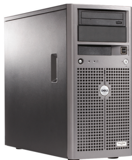
Dell PowerEdge 840

The PowerEdge 840 server gives small businesses and remote offices a flexible, affordable, reliable, and easy-to-manage solution.